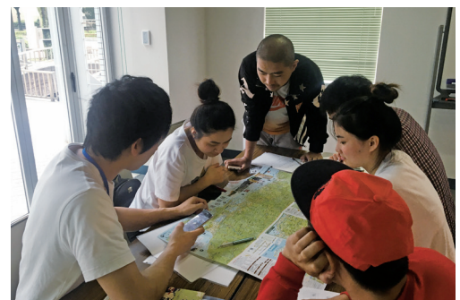
▲Japanese class in the western region

We're always looking for volunteers to help with our Japanese language classes. If interested, please visit your local TPIEF office. (Roles include providing basic explanations of the material and joining table discussions with learners.)